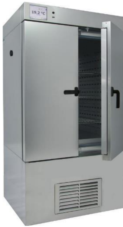
The photo above is for reference only, may show additional options not included in standard equipment. The real appearance, particularly color and structure of the material may differ from the ones presented in the photo.