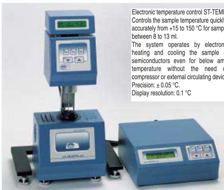
Electronic temperature controller ST-TEMP attached to the viscometer ST-DIGIT.