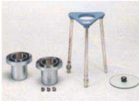
Flow cups standard models.

ACCESSORIES: Calibration standards in 470 ml flasks, comes complete with test certificate. All measurement at 25 °C.