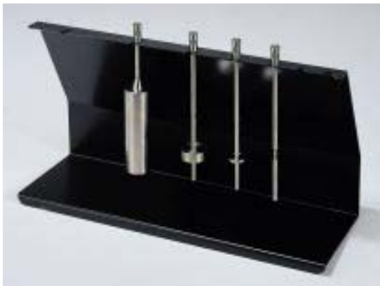
Rack support for spindle standards L1, L2, L3 and L4 for the ST-DIGIT L.