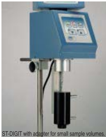
ST-DIGIT with adapter for small sample volumes.

Protectors for spindles. Part No. 1000991 for ST-DIGIT L. Part No. 1000992 for ST-DIGIT R.