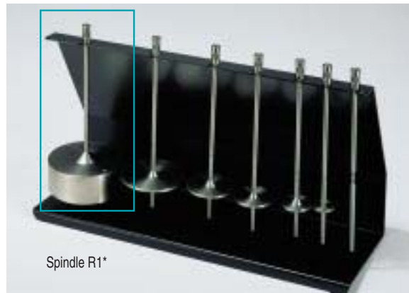
Rack support for spindle standards R2, R3, R4, R5, R6 and R7 for the ST-DIGIT R and H. * The R1 spindle is provided as an accessory.