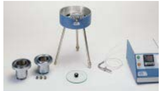
Temperature cups with threaded base that attaches to a water bath stand and "Electemp" temperature control unit.

ACCESSORIES: Tripod support stand and levelling disc with bubble level incorporated. Part No. 7001021