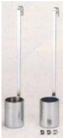
Cups with handles. Models DIN 53211 No. 4 and Ford ASTM D-1200.

For EFFLUX viscous sample measurements of paint, ink, varnish etc. from 5 to 700 cSt, model dependent. Metal cups made of tin, calibrated and chrome plated.