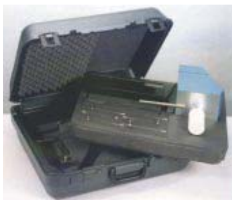
Carry case with corresponding sections for accessories and viscometer.