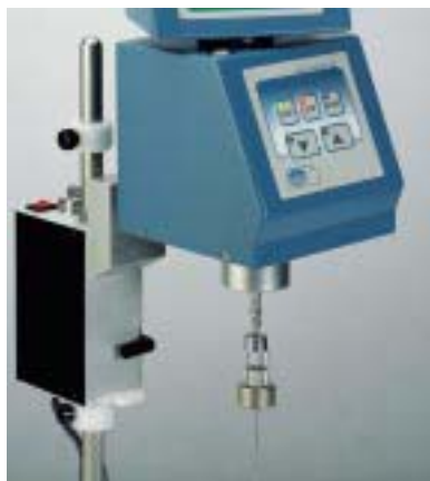
Model ST-DIDIT with displacement accessory.

Standard spindles are not suitable for measuring viscosity in creams, pastes, gelatine and fats etc. as they produce a cavity that will give erroneous results. For this type of sample a displacement accessory is required.