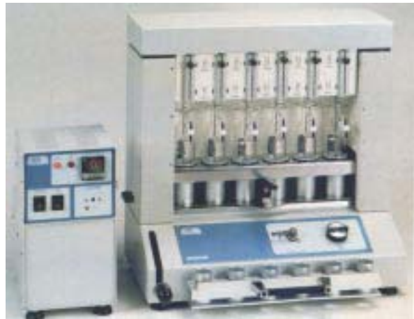
6 place extractor unit. Part No 4000842.

MAXIMUM SAFETY DURING THE SOLVENT EXTRACTION PHASE WITH SOLVENT HEATING BY LIQUID HEAT TRANSFER. INDEPENDENT HEATING AND TEMPERATURE CONTROL UNIT. REPRODUCIBLE RESULTS: \pm 1 %. EXTRACTION TIME: 40 MINUTES. 70 % SOLVENT RECOVERY.