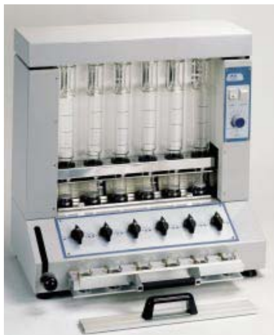
6 place extractor unit Part No 4000623