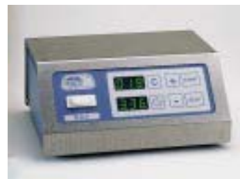
Electronic RAT controller.

Electronic controller with digital display of time and temperature. RAT. Part No 4000051