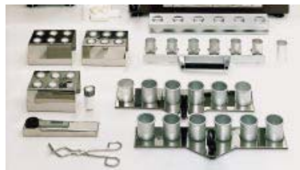
Equipment supplied with the 6 place model.