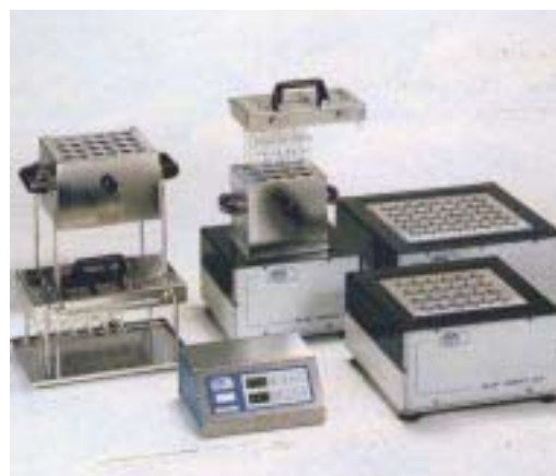
Display of a selection of MICRO 12, 24 and 40 place dry blocks with fume extractor and RAT controller.

Water Jet pump for vacuum extraction. Metallic suitable for the extraction of fumes for the 6, 12 and 24 around the condenser and place models. Part No. 7000293